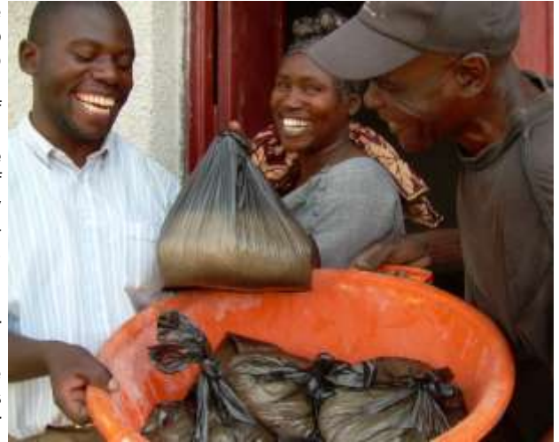
Heal Africa Staff and Volunteers help with food distribution.

Today we, and several of the HEALing Arts Mamas, walked to each room and gave the food to victims of: rape, burn, gunshot and knife wounds, and other patients of all kinds. They sang and smiled wide as they received the food! The stories are endless. One mother of six whose home was invaded by FARDC soldiers in a poor neighborhood of Goma. The soldiers demanded all her money, and when they discovered that she had none, they stabbed her in the chest near the heart. This mother is pregnant. She has been at the hospital since October 29 th , the day of the attacks in Goma, and her mother is her caretaker. Her face shows decades of suffering accentuated by the recent anguish of trying to find food for her suffering daughter. Although the young mama lost weight at the beginning, she is slowly starting to regain strength and is very happy that her baby was not affected by the knife wound. People like this vulnerable mother have now received enough food to get them through the next several days. Currently, we have around 300 patients at the hospital. The few days surrounding the